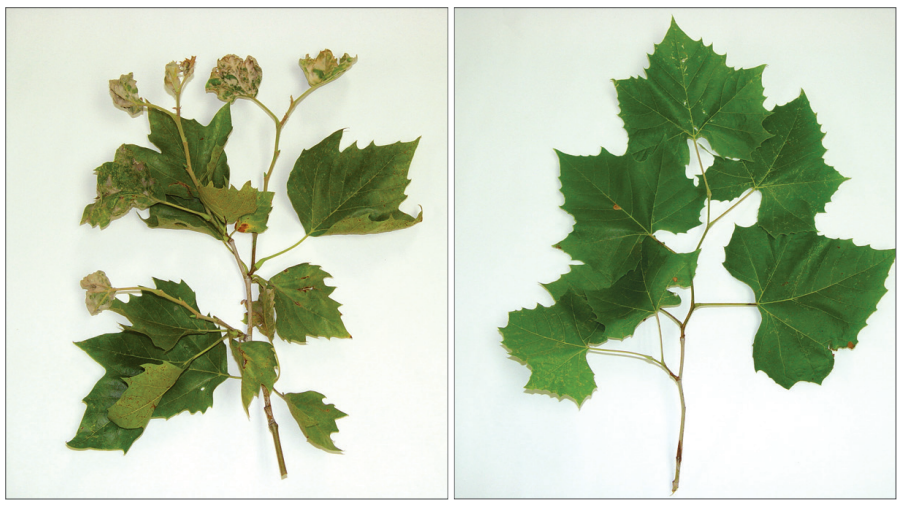
Sycamore with Anthracnose

Research at Michigan State University shows that PHOSPHO-jet suppresses fire blight of apple by activating production of defensive proteins against plant pathogenic bacteria.