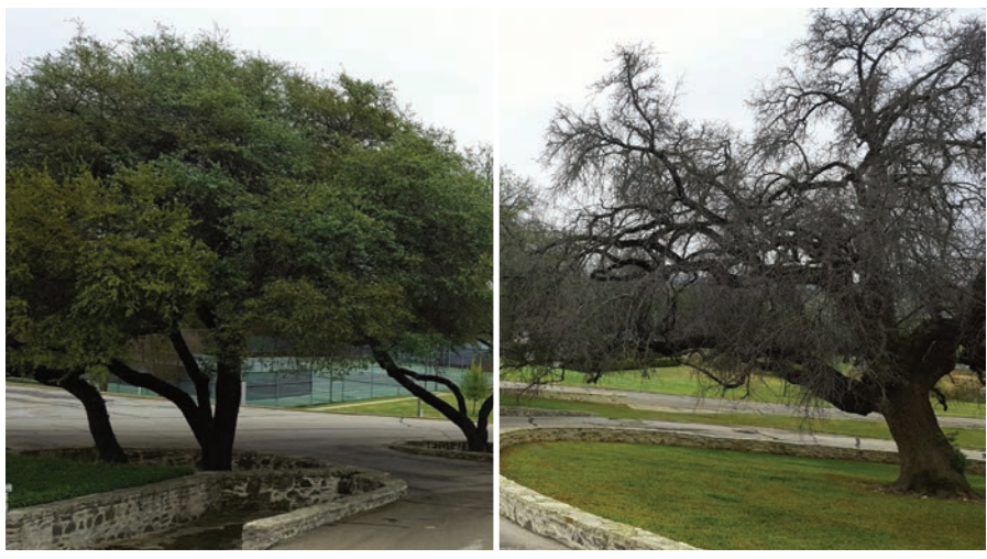
Treated at early stages

Fall injections ensure that the treatment will be in place prior to bud break, slowing the spread of infection and helping the tree to foliate more normally.